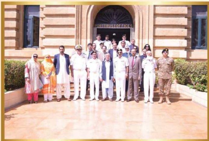
Participants of Maritime Security Workshop (Marsew) Visited KPT Head Office on 19.9.2017