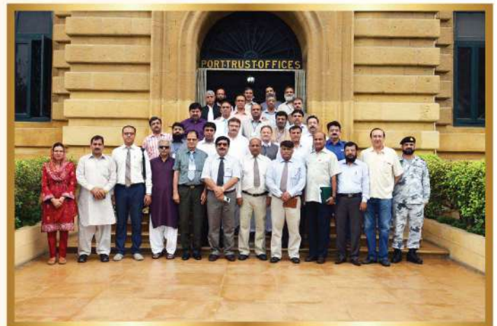
Group photo of WAPDA Administrative Staff College delegation is taken on the occasion of their visit of KPT Head Office on 03-08-2017