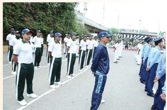
Pakistan Colour Holder Players contingent participated in Independence Day Parade for the first time in the history of KPT