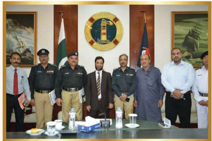
DIG Traffic Visited KPT Head Office on 05-07-17