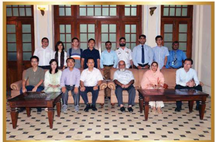
Group Photo of Chinese delegation is taken during their visit at KPT Head Office on 21-08-2017