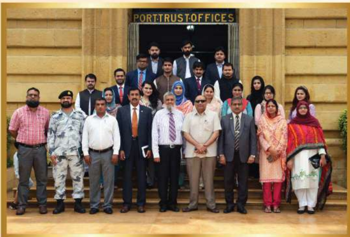
Group photo of delegation of OMG Probationers is taken during their visit at KPT Head Office on 03-08-2017