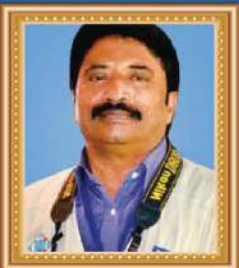
Zubair Ayyub Assistant Photographer