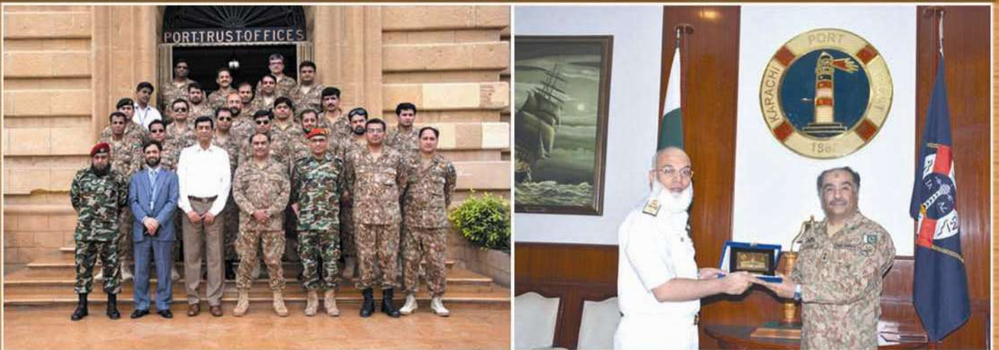
A group photo of Logistics Staff Course (LSC-65) of Army School of Logistic Kuldana Murree is taken on the occasion of their visit to KPT Head Office on 11th June 2015