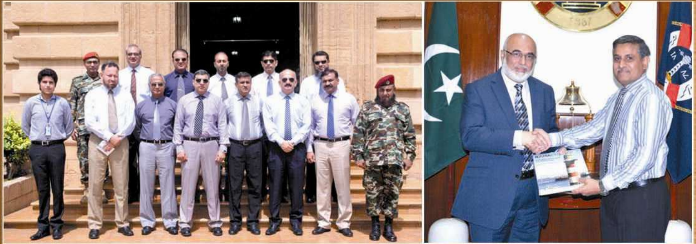
A group photo of Designate Attaches of Pakistan delegation is taken on the occasion of their visit to KPT Head Office on 3rd June 2015