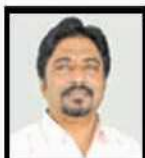
Zubair Ayyub Assistant Photographer