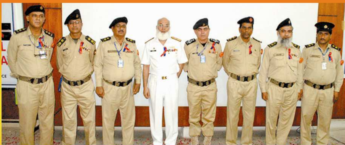
PORT FIRE SERVICE COMMAND WITH DIVISIONAL HEAD GENERAL MANAGER ENGINEERING