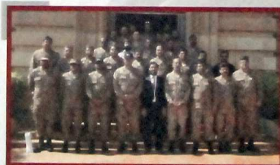
Army School of Logistics Kuldana, Murree visited KPT Head Office on 26-10-2017.