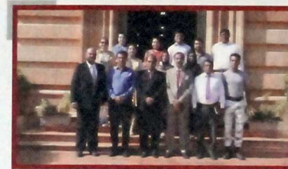
Probationary Officers of Pakistan Railways visited KPT Head Office on 23-11-2017 .