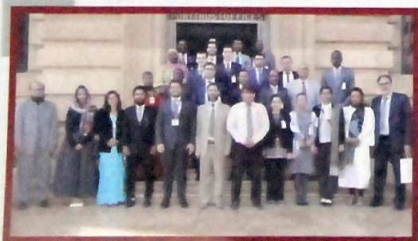
Foreign Diplomats of 25th junior diploma course visited KPT Head Office on 06-12-2017.