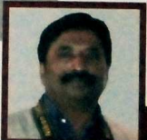
Zubair Ayyub Assistant Photographer