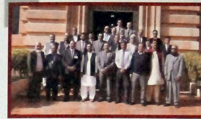
A Study Tour of WAPDA Engineering Academy Faisalabad visited KPT Head Office on 05-12-2017.