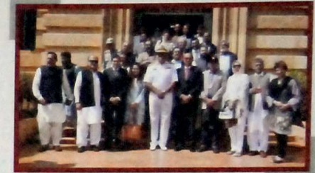
Delegation of National Security Workshop visited KPT Head Office on 04-10-2017.