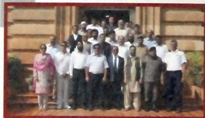
Wapda Administrative Staff College visited KPT Head Office on 27-10-2017.