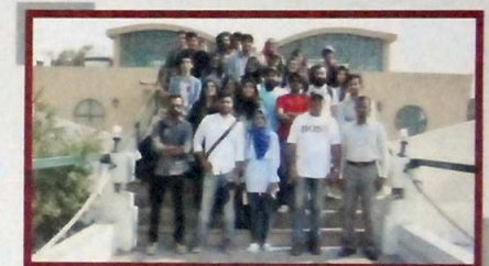
The Students of SZABIST visited KPT Head Office on 12-11-2017.